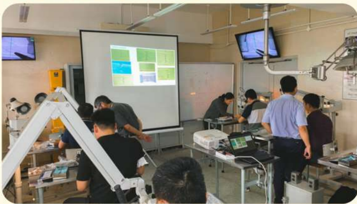
Microsurgery Training Program

15 reports were presented at the 2021 annual meeting of Hand Surgeons. This included cases of trauma, peripheral nerve injury, reconstruction, plastic surgery, and congenital deformities. The meeting attracted more than 70 surgeons on site and 100 on line. In the 2022 annual meeting of Orthopaedic Network, 5 presentations of Hand Surgery were selected for presentation during the main session. This was the first Orthopaedic meeting on-site after the nation wide lock down was lifted. More than 250 surgeons attended it.