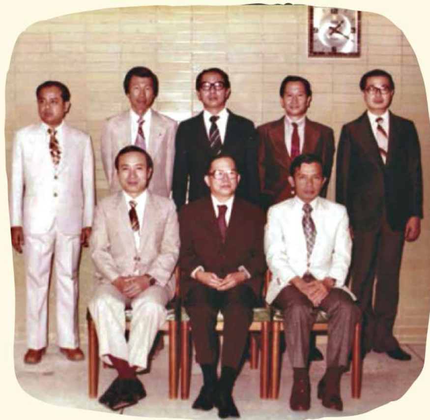
The First Committee of the Thai Society for Surgery of the Hand

The objectives of the Thai Society for Surgery of the Hand are exchanging experiences, sharing, and strengthening knowledge of Hand Surgery as well as training and extending the knowledge to residents and surgeons who take responsibility in Hand Surgery.