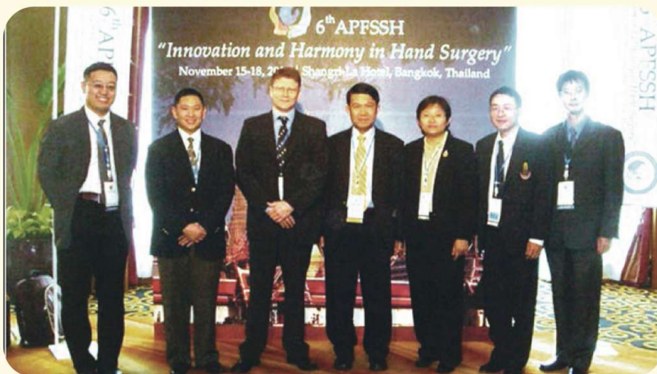
The 6th APFSSH held in Bangkok, 2006