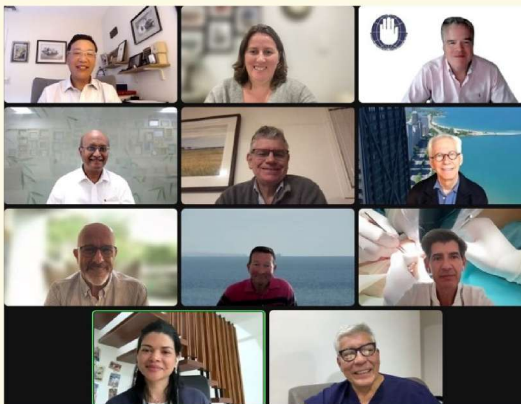
IFSSH Ex-Co Meeting - 2022

The IFSSH is ideally placed to support global collaboration in hand surgery. Some IFSSH Member Societies across the world already support well established outreach programmes for low- and middle-income countries providing surgical teams, educational resources and even certification. Other Member Societies may need to receive this help. There are other countries who do not have their own hand societies and so are not part of IFSSH who need the most help. Our IFSSH delegates and members-at-large, will help us understand who needs what and who provides what. Co-ordination between some organisations is already underway to avoid duplication and create synergy in global provision. A simple repository on our website can link key individuals in different societies and provide access to learning material and programmes at no cost to all those who need it.