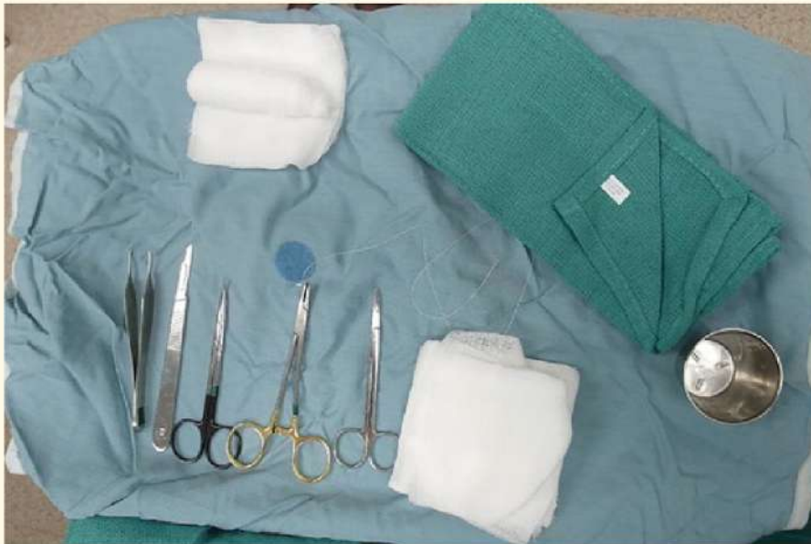
Basic Tray for all WALANT Procedures