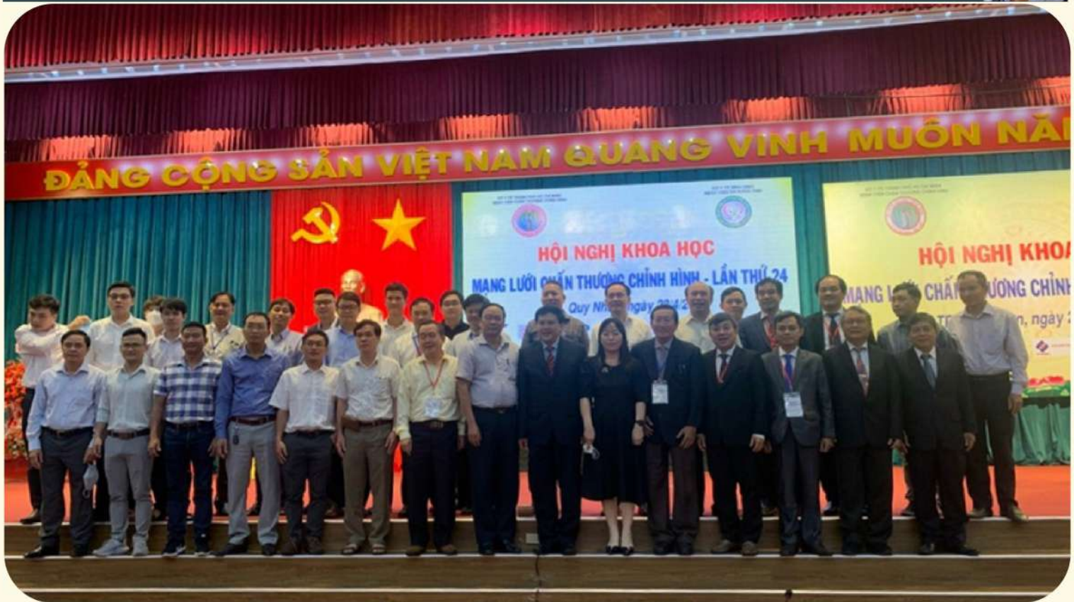
Orthopaedic Network Meeting 2022