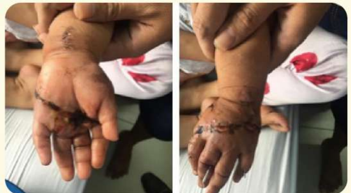
Appearance 10 days post replantation