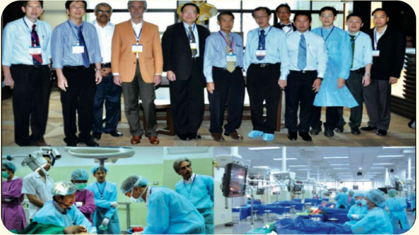
The 1st Brachial plexus Cadaveric course at Chulalongkorn University in 2012