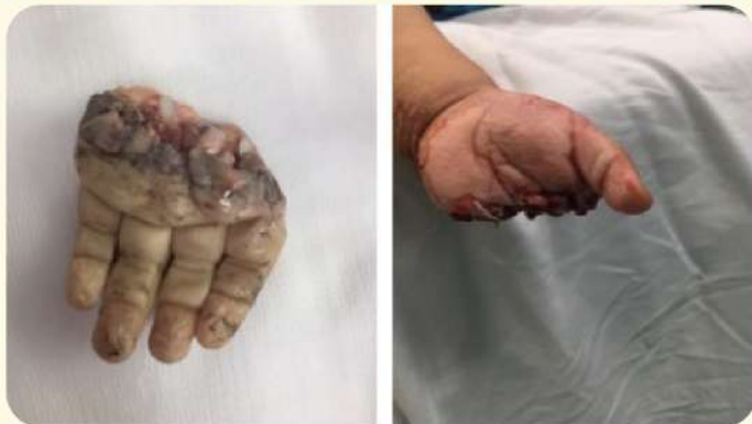
Trans-metacarpal right hand amputation

Replantation on children is always challenging. A 12-month-old child was admitted with her severed right hand 5 hours after a traffic accident. The hand was successfully replanted.