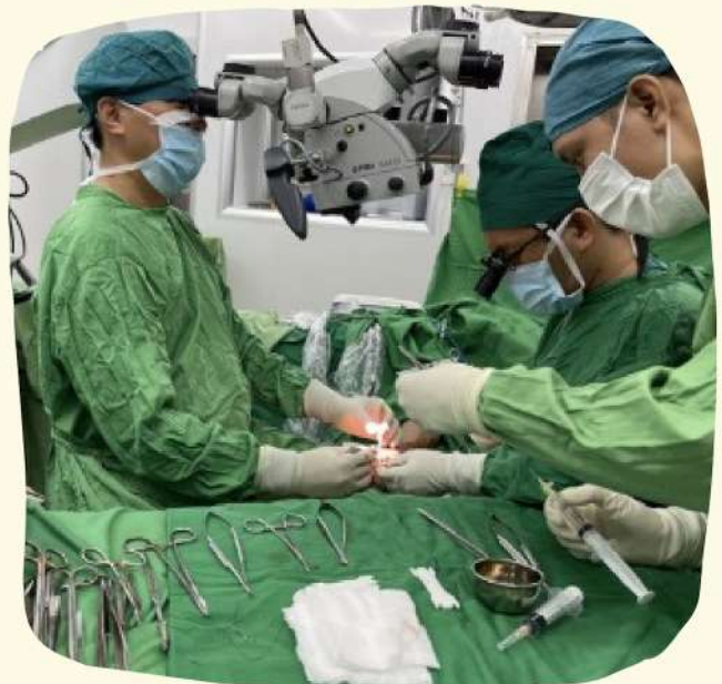
Nerve grafting under supervision

Helping colleagues in other specialities to improve their microsurgical skill has gradually become a routine duty for Hand Surgeons. In 2021, two 'technical skill transfer tours' were launched with four Hand Surgeons. Young orthopaedic surgeons had opportunity to discuss some complex cases and then do microsurgical reconstruction under supervision.