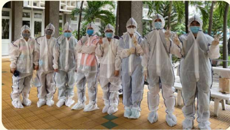
Hand Surgeons getting ready to go to a 'hot-spot' to collect viral specimens

Vietnam had the first Covid infected cases at the end of the year 2019 and became one of the most seriously impacted countries in South East Asian region. During the two years 2020-2021 the country has suffered 4 outbreaks which badly affected all