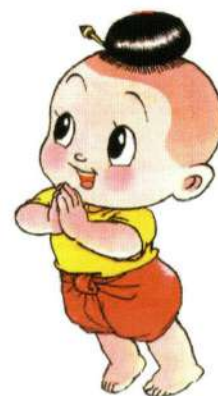
FIG. 2 Thailand Greeting - "wai".